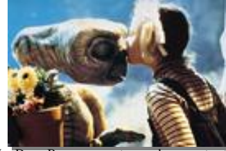
Was Drew Barrymore not enough reason to stay?

Beginning his service in the summer of 1982, E.T. was welcomed with open arms into the homestay family of Elliot, Michael, and Gertie. Tensions arose early and misunderstandings ensued as our visitor became acclimatized to our Earthly customs and 78% level of atmospheric nitrogen. However, were those differences severe enough for E.T. to throw his arm appendages up and say, "Nuts to this," terminating his service within days upon arrival?