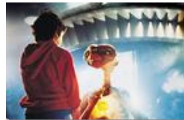
E.T. leaving us. Forever. Lousy quitter.

Earthlings everywhere are still torn in debate.